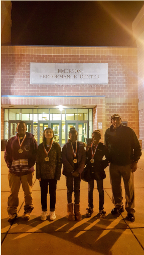
Normandy students medal at Gateway Chess tournament at Harris Stowe.